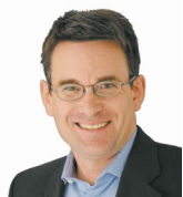
Brain Mayes – City Councilor Colleen Mayer -MLA

We serve the home mechanic, the repairperson, the trade professional, the inventor... basically, the "hands-on" type who likes to figure things out for themselves. We exist because of our customer. We aim to provide the tools and equipment they need, and offer an outstanding shopping experience backed by our Princess Auto Guarantee: "No sale is final until you're satisfied". That means we will gladly repair, replace, or refund any product to your satisfaction. We mean it.